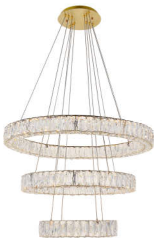
Gold Item No:3503G3LG