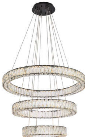
Black Item No:3503G3LBK